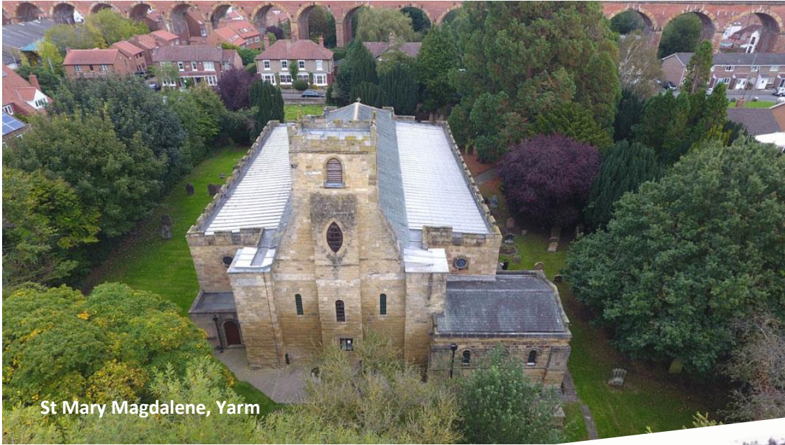
St Mary Magdalene, Yarm