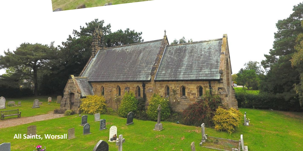
All Saints, Worsall