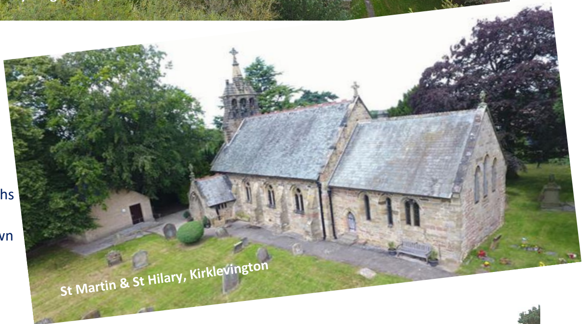
St Martin & St Hilary, Kirklevington